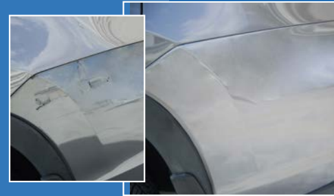
Bumper Bar Scrapes & Scratches