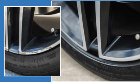
Alloy Wheel Scrapes