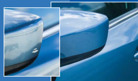
Side Mirror Scrapes & Scratches